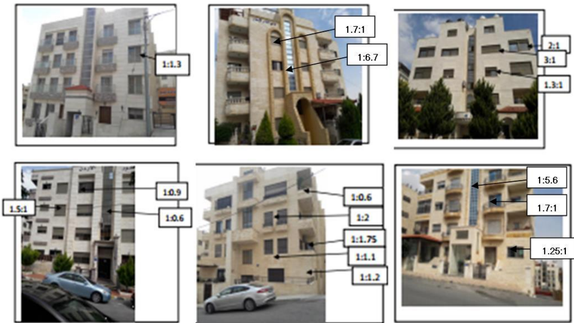
Figure 3: Openings' proportions for six adjacent

How to explain the similarity of buildings in Sham area, within a radius of a 500km, while buildings within small area in street are completely different. Although these buildings are well constructed and use the latest building materials, they have little knowledge of their properties. It can be said that these building are similar in using stone cladding of limestone in their facade, which is available in the Kingdom, but this not reflect the real knowledge of their characteristic, when compared to the use of stone over the past centuries. There is no harm in using inherited opening ratios, as long as the windows and opening have the same function?