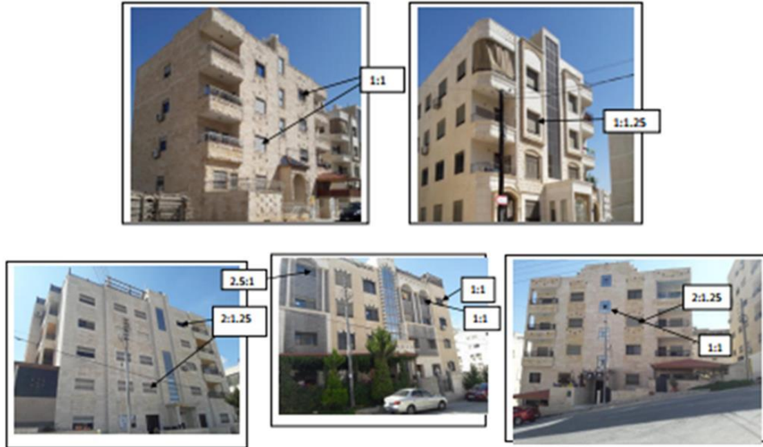
Figure 2: Openings' Proportions for five new buildings in the same location within 200m distance in Amman