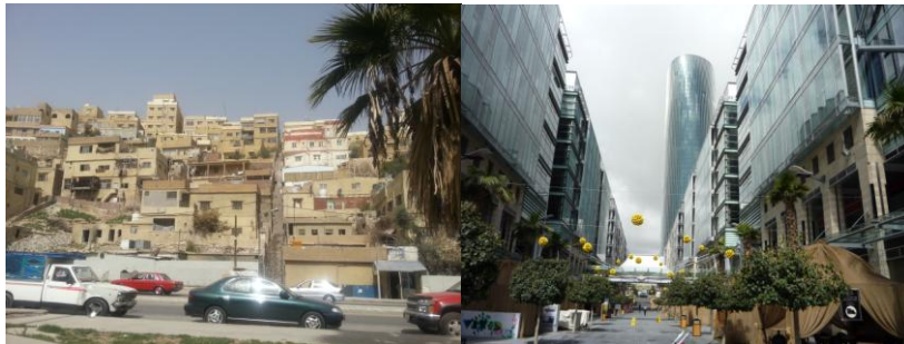
Fig. 2: The transformation of architectural style in Amman over the last three decades

In contrast, the architectural style of new developments, especially commercial buildings followed the Hi-Tech global styles, cubic irregular glass dominating the image of the city. This had a profound impact on shifting “the localized architectural identities to an attempt to fit within overall global development” (Potter, 2009: p28).