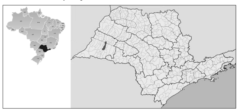
Figure 1 - Location of the Municipality of Presidente Prudente in the State of São Paulo - Brazil

Since its beginning, this town features populism<sup>7</sup> as a model of municipal government, fact that contributes to the absence of an effective and coherent urban planning and management process (Leite, 1972).