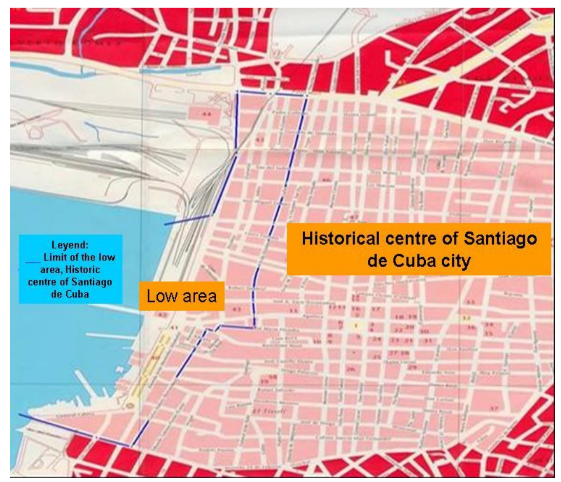
Figure 1: Delimitation of the Lower Area of the Historic Center of Santiago de Cuba (Blue Boundaries)

As result of this situation, several studies where been done to classify the injuries, but there is a lack of awareness of the interrelationship of the environment with the whole building where a key player is water. Given the situation it is clear that there are problems of an economic, social, environmental, sociocultural and education.