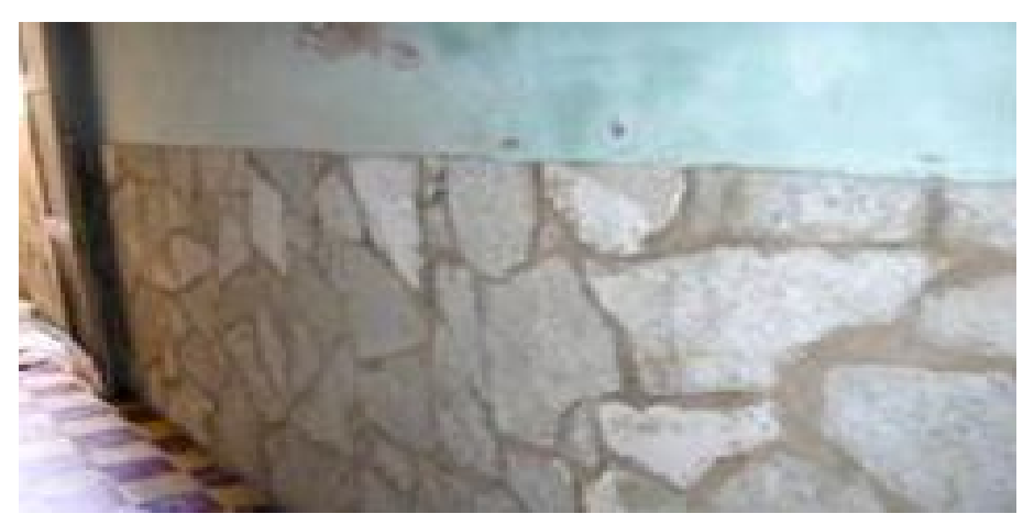
Figure 4: Flagstone Veneer Buildings in the Historic Center Santiago. Note the Capillary Phenomenon over the Slabs

The construction materials frequently used of these buildings are naturally absorbent and porous, as in the case of masonry, ie (solid brick, hollow brick, natural stone, etc.). Enluciados plaster or cement, which may have impaired due to water absorption, which leads to the formation of salts, mosses and efflorescence. These events in turn cause dimensional changes in the components, causing cracks and fissures parallel vertical and located in areas with easy wetting and drying continues (starts foundation with damp hair and coronations bit protected facades). On the walls there are stains, includes painting and finally begin to discard the plaster or coatings (see Figure 5).