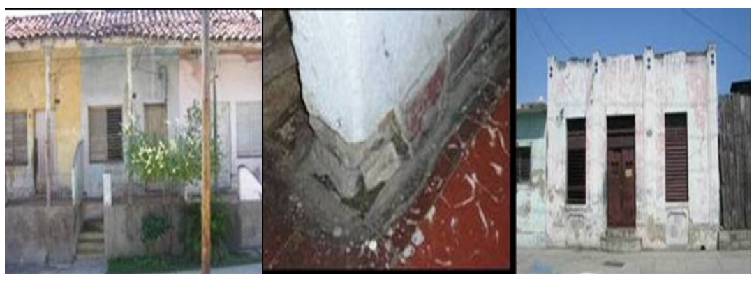
Figure 5: Deterioration in Facades and Walls of Buildings in the Historic Center Santiago

The construction materials frequently used of these buildings are naturally absorbent and porous, as in the case of masonry, ie (solid brick, hollow brick, natural stone, etc.). Enluciados plaster or cement, which may have impaired due to water absorption, which leads to the formation of salts, mosses and efflorescence. These events in turn cause dimensional changes in the components, causing cracks and fissures parallel vertical and located in areas with easy wetting and drying continues (starts foundation with damp hair and coronations bit protected facades). On the walls there are stains, includes painting and finally begin to discard the plaster or coatings (see Figure 5).