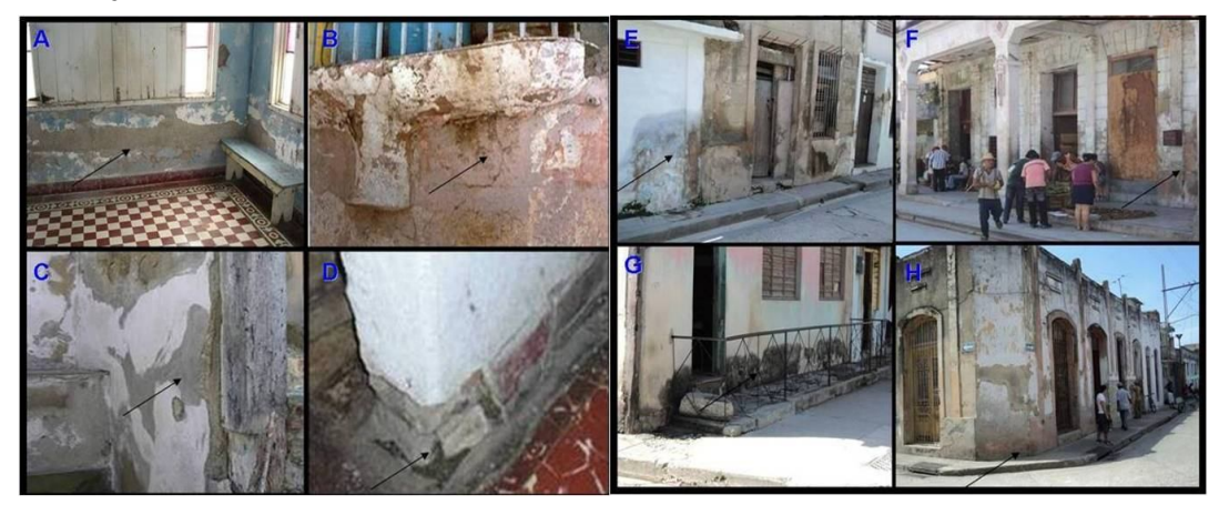
Figura 3: Attack of the Capillarity Humidity in Buildings of the Study Area. A, C y D: Inside Houses Locations; B, E, F, G y H: Facades

As you can see the deterioration of buildings is critical and the appearance of the lesion is common in batches with high capillary heights. Figure 3 shows images of the state of the buildings in this area by capillarity humidity attack.